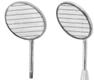
SF-5-5117 Parallelometer mouth mirror