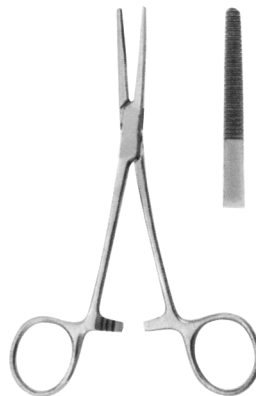
SF-6-5173 Kelly 14 cm