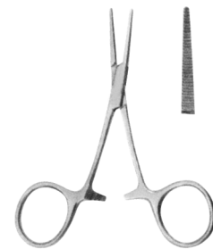
SF-6-5175 Micro-Mosquito 10 cm