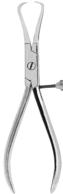
SF-6-5169 Furrer 16 cm