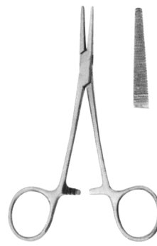
SF-6-5174 Halstead-Mosquito 12 cm