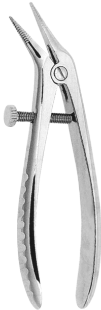
SF-6-5167 Bohm 11,5 cm