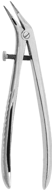
SF-6-5168 Bohm 14,5 cm