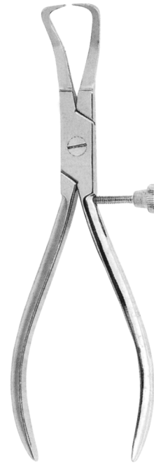
SF-6-5170 Furrer 16 cm