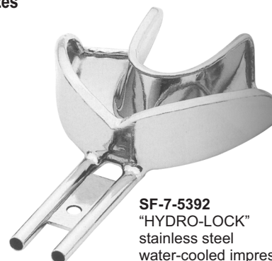
SF-7-5392 "HYDRO-LOCK" stainless steel water-cooled impression trays with retention rim.