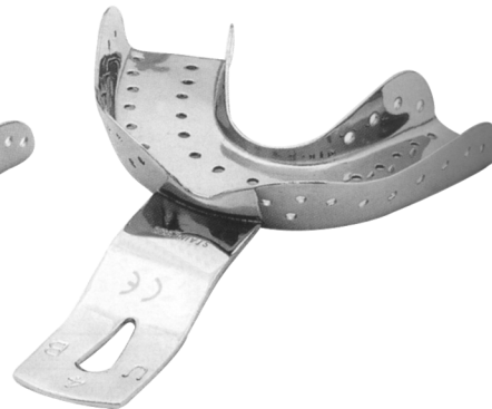
SF-7-5419 Fig. 0 per bambini - for children