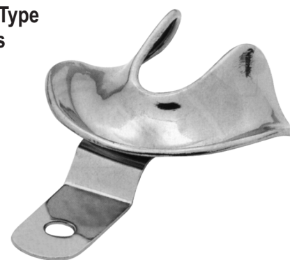
SF-7-5425 Solid total denture stainless steel impression tray with rim.