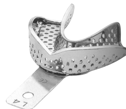
SF-7-5427 "PERMA-LOCK" perforated regular stainless steel impression trays with retention rim.