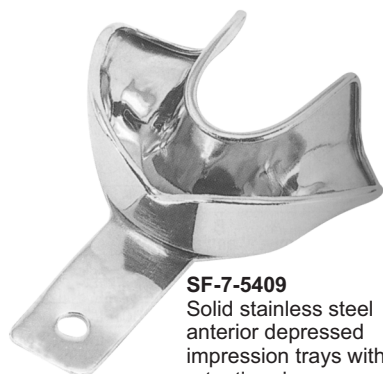
SF-7-5409 Solid stainless steel anterior depressed impression trays with retention rim.