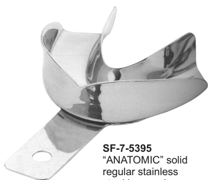
SF-7-5395 "ANATOMIC" solid regular stainless steel impression trays without retention rim.