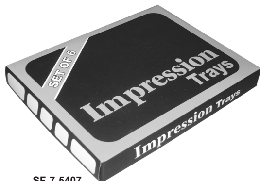
SF-7-5407 Set of six