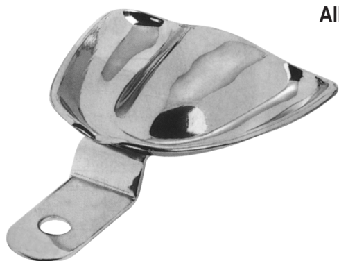
SF-7-5424 Solid total denture stainless steel impression tray with rim.

All Impression Trays Upper & Lower Type are available in S, M, L & XL Sizes