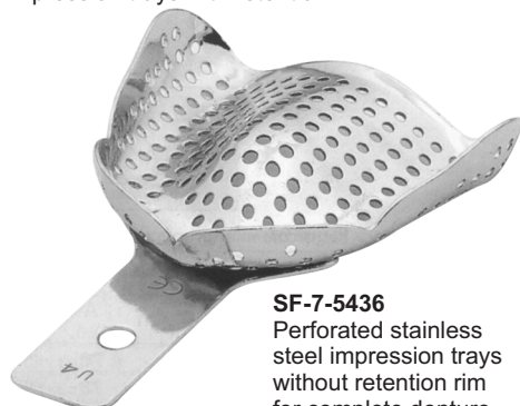
SF-7-5436 Perforated stainless steel impression trays without retention rim for complete denture.