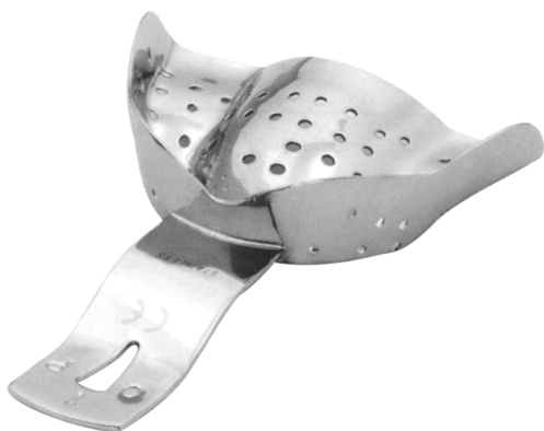
SF-7-5420 For partially toothed upper jaws