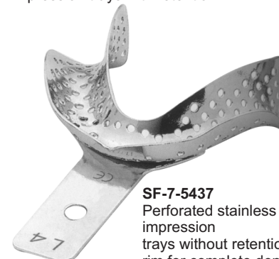
SF-7-5437 Perforated stainless steel impression trays without retention rim for complete denture.