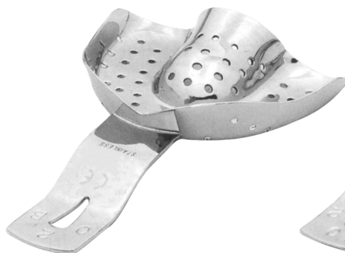
SF-7-5417 Fig. 0 per bambini - for children

All Impression Trays Upper & Lower Type are available in S, M, L & XL Sizes