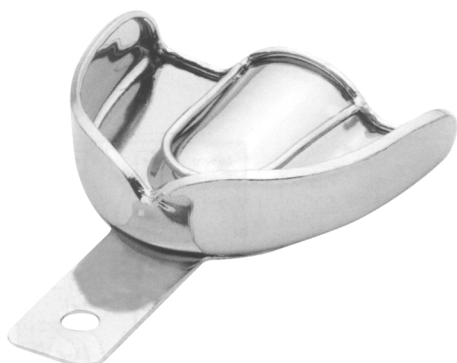
SF-7-5399 "PERMA-LOCK" solid regular stainless steel impression trays with retention rim.

All Impression Trays Upper & Lower Type are available in S, M, L & XL Sizes