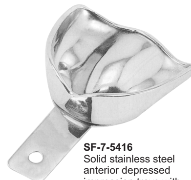
SF-7-5416 Solid stainless steel anterior depressed impression trays with retention rim.