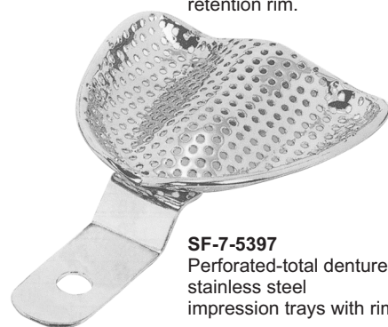
SF-7-5397 Perforated-total denture stainless steel impression trays with rim.