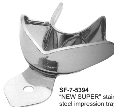
SF-7-5394 "NEW SUPER" stainless steel impression trays with retention rim.