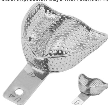
SF-7-5428 Perforated stainless steel anterior depressed impression trays with retention rim.