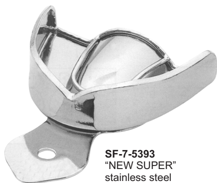
SF-7-5393 "NEW SUPER" stainless steel impression trays with retention rim.