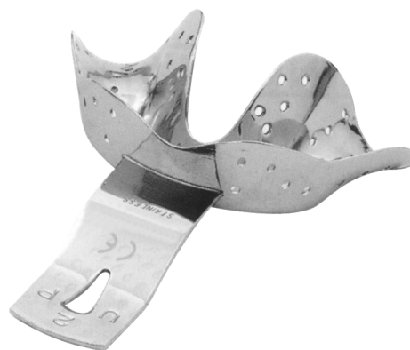
SF-7-5421 For partially toothed lower jaws