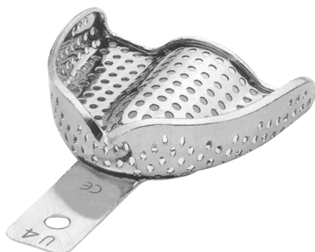
SF-7-5426 "PERMA-LOCK" perforated regular stainless steel impression trays with retention rim.