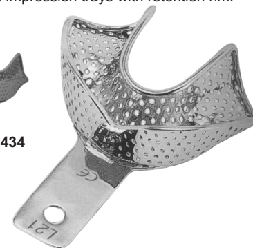
SF-7-5435 Perforated stainless steel anterior depressed impression trays with retention rim.