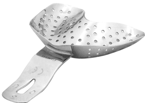
SF-7-5422 For edentulous upper jaws