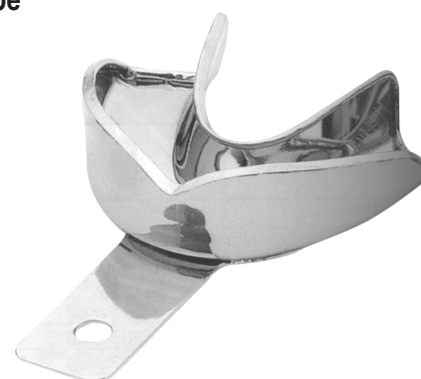
SF-7-5400 "PERMA-LOCK" solid regular stainless steel impression trays with retention rim.