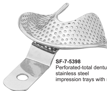
SF-7-5398 Perforated-total denture stainless steel impression trays with rim.