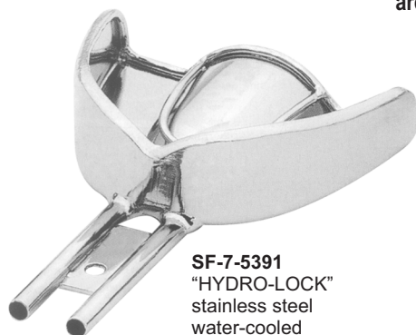
SF-7-5391 "HYDRO-LOCK" stainless steel water-cooled impression trays with retention rim.

All Impression Trays Upper & Lower Type are available in S, M, L & XL Sizes