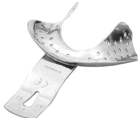
SF-7-5423 For edentulous lower jaws