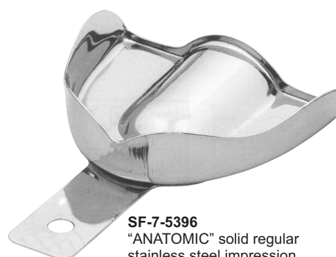
SF-7-5396 "ANATOMIC" solid regular stainless steel impression trays without retention rim.