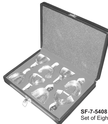
SF-7-5408 Set of Eight